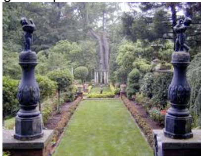
The garden path at Meadowbrook Farm

Our annual picnic will follow the meeting. Please plan to stay. Details can be found on the next page. Following the picnic, plan for a stroll around the gardens and retail display areas.