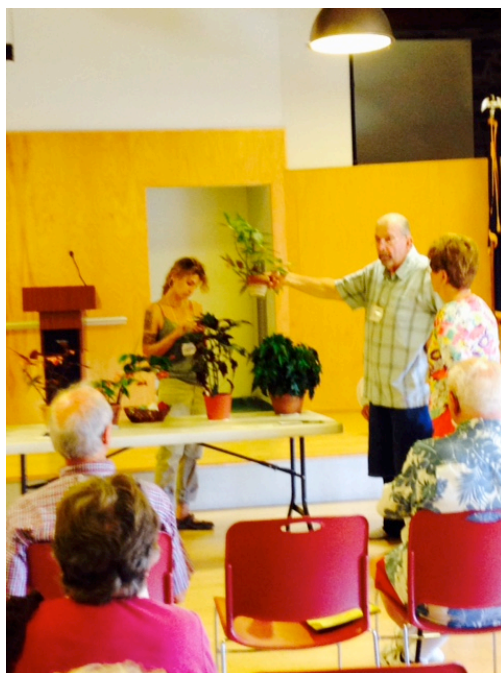
The judges hard at work during the show